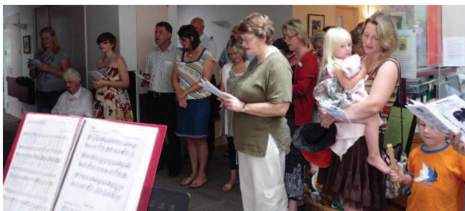
Carols in IPU