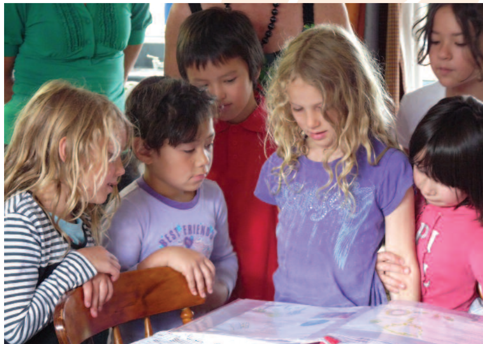
Purua School students read from their book of poems

Newberry's Funeral Services for the installation of the air conditioning unit in the computer room.